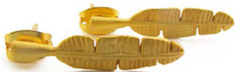
SMALL MATT GOLD BANANA LEAF STUDS CODE: S17INE5 COST: R 180 LENGTH: 2,6CM MATERIALS: 22KT GOLD PLATED BRASS