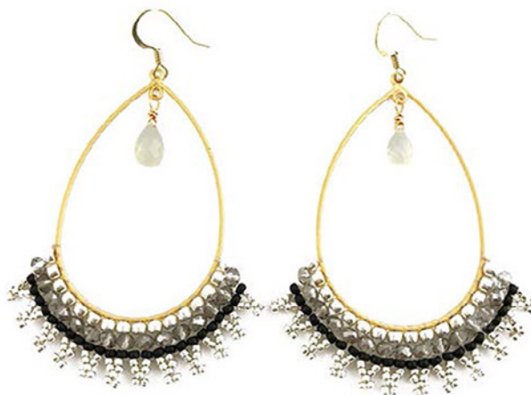
MATT GOLD BEADED TEARDROPS WITH WHITE CHALCEDONY BRIOLETTES CODE: S17GE54 COST: R 475 LENGTH: 8CM MATERIALS: 22KT GOLD PLATED BRASS, CHALCEDONY, SEED BEADS