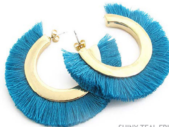
SHINY TEAL FRINGE HOOPS CODE: S17GE27 COST: R 260 LENGTH: 5,5CM MATERIALS: COSTUME JEWELLERY