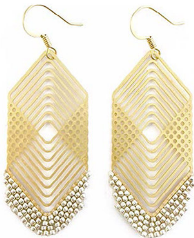
GOLD BEADED GEOMETRIC EARRINGS CODE: S17GE48 COST: R 350 LENGTH: 6,7CM MATERIALS: BRASS, SEED BEADS