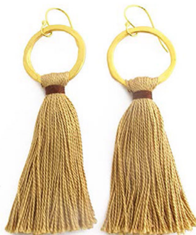
LARGE LATTE TASSEL EARRINGS CODE: S17GE32 COST: R 300 LENGTH: 10,5CM MATERIALS: 22KT GOLD PLATED BRASS