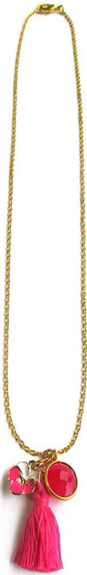
NECKLACE WITH PANSY AND SET PINK CHALCEDONY CODE: S17INN5 COST: R 300 LENGTH: 24,5CM MATERIALS: 22KT GOLD PLATED BRASS, PINK CHALCEDONY