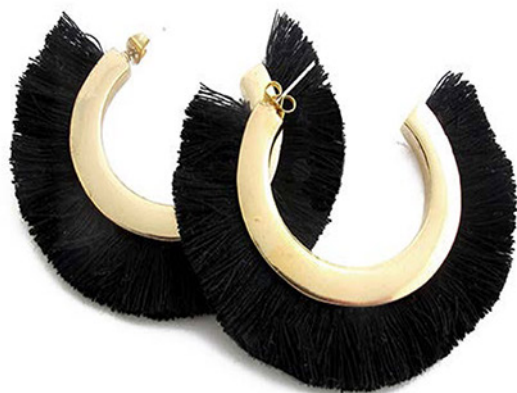
SHINY BLACK FRINGE HOOPS CODE: S17GE26 COST: R 320 LENGTH: 5,7CM MATERIALS: COSTUME JEWELLERY