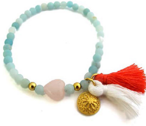
CHALCEDONY BEADS AND ROSE QUARTZ HEART BRACELET WITH TASSELS CODE: S17GB13 COST: R 200 LENGTH: ADJUSTABLE MATERIALS: 22KT GOLD PLATED BRASS, CHALCEDONY, ROSE QUARTZ