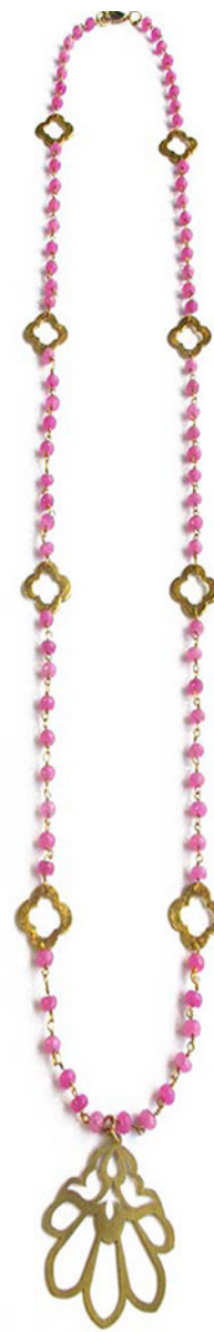
PINK RUBY RONDELLES WITH FLOWER PENDANT CODE: S17GN26 COST: R 770 LENGTH: 40,5CM MATERIALS: 22KT GOLD PLATED BRASS, RUBY QUARTZ