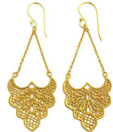
MATT GOLD LACE CHAIN EARRINGS CODE: S17INE3 COST: R 350 LENGTH: 7,2CM MATERIALS: 22KT GOLD PLATED BRASS