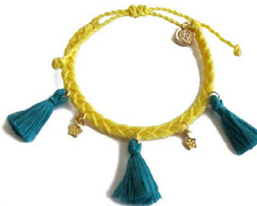
YELLOW BRAIDED STAR CHARM BRACELET CODE: S17GB57 COST: R 200 LENGTH: ADJUSTABLE MATERIALS: 22KT GOLD PLATED BRASS