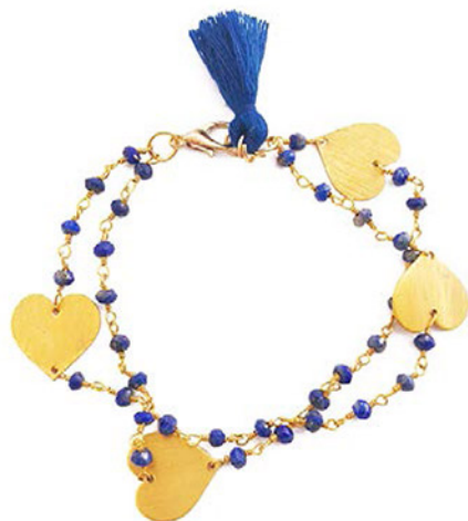
LAPIS LAZULI RONDELLE & GOLD HEART DOUBLE BRACELET CODE: S17GB32 COST: R 350 LENGTH: ADJUSTABLE MATERIALS: 22KT GOLD PLATED BRASS, LAPIS LAZULI