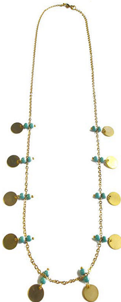
NECKLACE WITH GOLD DISKS AND TURQUOISE CODE: S17GN3 COST: R 350 LENGTH: 30,5CM MATERIALS: 22KT GOLD PLATED BRASS, TURQUOISE