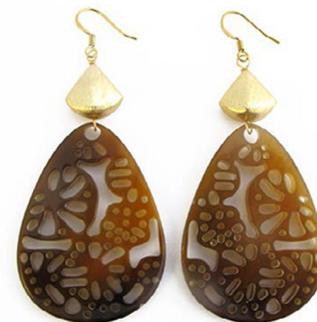
TEARDROP FILIGREE WITH GOLD BEAD CODE: S17GE18 COST: R 300 LENGTH: 8,5CM MATERIALS: 22KT GOLD PLATED BRASS, HORN