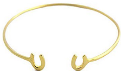
SHINY GOLD HORSE SHOE BRACELET CODE: S17INB1 COST: R300 LENGTH: ADJUSTABLE MATERIALS: 22KT GOLD PLATED BRASS