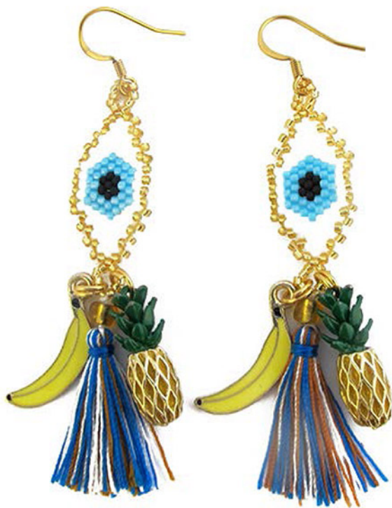
EVIL EYE, TASSEL AND FRUITY EARRINGS CODE: S17GE21 COST: R 300 LENGTH: 8CM MATERIALS: COSTUME JEWELLERY