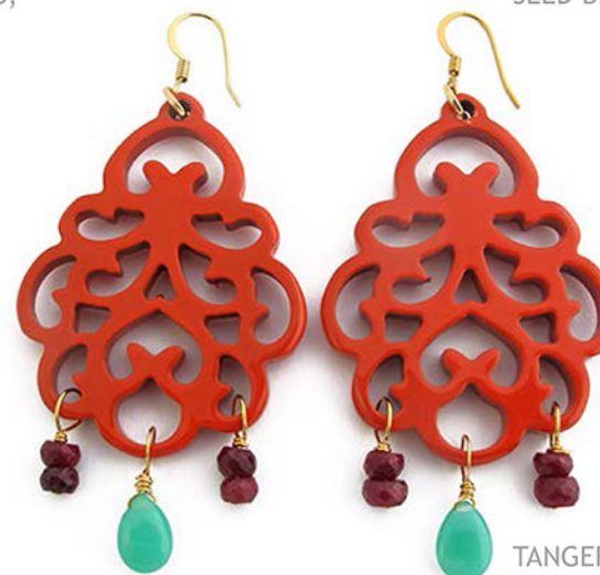
TANGERINE FILIGREE EARRINGS WITH RUBY QUARTZ & CHRYSOPRASE CODE: S17GE15 COST: R 350 LENGTH: 7,2CM MATERIALS: HORN, RUBY QUARTZ, CHRYSOPRASE