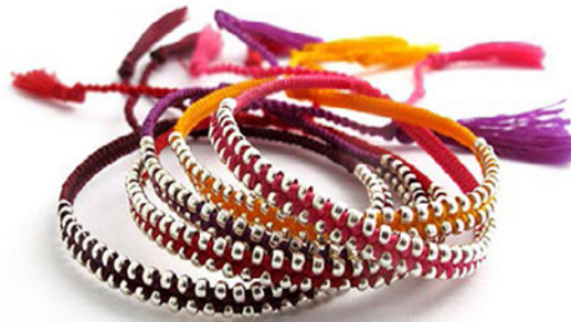
SET OF ASSORTED COLOUR ADJUSTABLE BRACELETS CODE: S17GB1 COST: R 360 LENGTH: ADJUSTABLE MATERIALS: COSTUME JEWELLERY