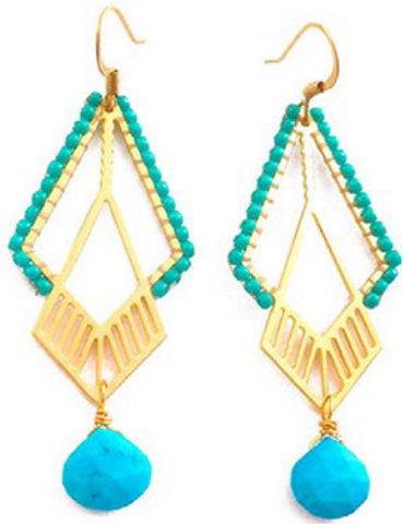
SHINY GOLD GEOMETRIC EARRINGS WITH TURQUOISE BRIOLETTES CODE: S17GE45 COST: R345 LENGTH: 7,8CM MATERIALS: 22KT GOLD PLATED BRASS, TURQUOISE, SEED BEADS