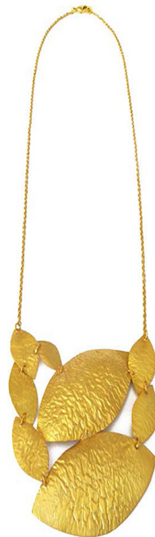
SHORT MATT GOLD LEAF CLUSTER NECKLACE CODE: S17INN1 COST: R 300 LENGTH: 26,5CM MATERIALS: 22KT GOLD PLATED BRASS