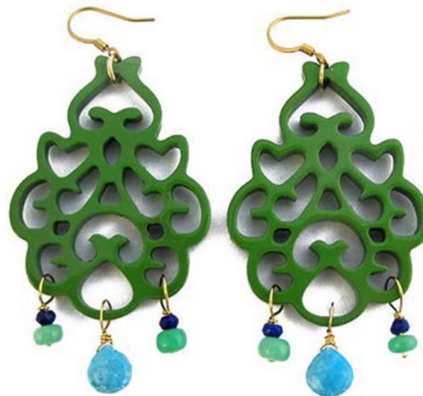
GREEN FILIGREE AND GEM EARRINGS CODE: S17GE8 COST: R 220 LENGTH: 7,1CM MATERIALS: HORN, TURQUOISE, CHRYSOPRASE, LAPIS