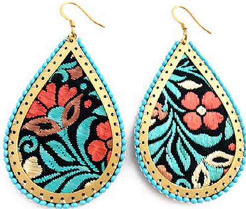
LARGE TURQUOISE AND CORAL EMBROIDERED EARRINGS CODE: S17GE58 COST: R540 LENGTH: 7,5CM MATERIALS: BRASS, SEED BEADS, SILK