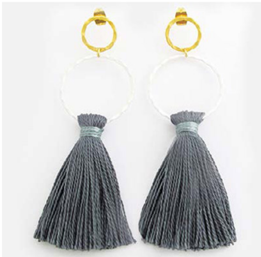
MATT SILVER & GOLD CIRCLE TASSEL EARRINGS CODE: S17INE17 COST: R 350 LENGTH: 8,6CM MATERIALS: 22KT GOLD PLATED BRASS, SILVER PLATED BRASS