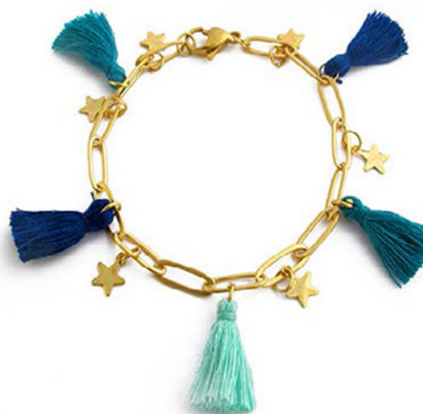
MATT GOLD CHAIN WITH STARS AND TASSELS CODE: S17GB37 COST: R 250 LENGTH: 21CM/ADJUSTABLE MATERIALS: 22KT GOLD PLATED BRASS