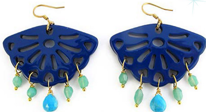
COBALT BUTTERFLY EARRINGS WITH GEMS CODE: S17GE3 COST: R 450 LENGTH: 5CM MATERIALS: HORN, TURQUOISE, CHRYSOPRASE