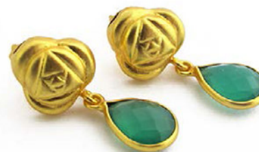
MATT GOLD ROSE STUDS WITH GREEN ONYX CODE: S17INE8 COST: R 380 LENGTH: 2,8CM MATERIALS: 22KT GOLD PLATED BRASS, GREEN ONYX