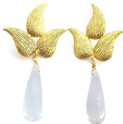
MATT GOLD TEXTURED FLOWER EARRINGS WITH CRYSTAL QUARTZ CODE: S17INE19 COST: R 400 LENGTH: 5CM MATERIALS: 22KT GOLD PLATED BRASS, CRYSTAL