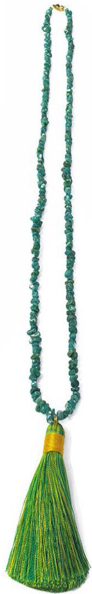
AMAZONITE NECKLACE WITH GREEN TASSEL CODE: S17GN5 COST: R220 LENGTH: 49,5CM MATERIALS: AMAZONITE