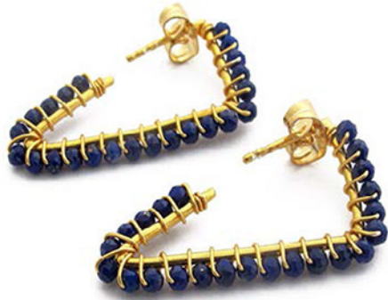
SMALL HOOK EARRINGS WRAPPED WITH LAPIS RONDELLES CODE: S17INE21 COST: R 380 LENGTH: 2,2CM MATERIALS: 22KT GOLD PLATED BRASS, LAPIS LAZULI