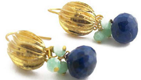
MATT GOLD WALNUT EARRINGS WITH LAPIS LAZULI CODE: S17GE30 COST: R 390 LENGTH: 3,4CM MATERIALS: 22KT GOLD PLATED BRASS, LAPIS LAZULI