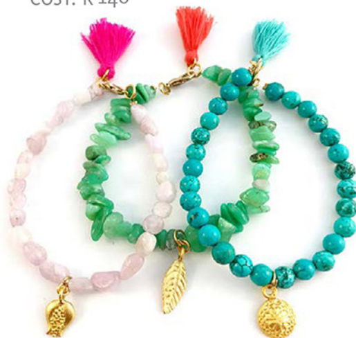
PINK POMEGRANATE BRACELET CODE: S17GB35 COST: R 220 CHRYSOPHASE LEAF BRACELET CODE: S17GB33 COST: R 220 TURQUOISE DISK BRACELET CODE: S17GB35 COST: R 140