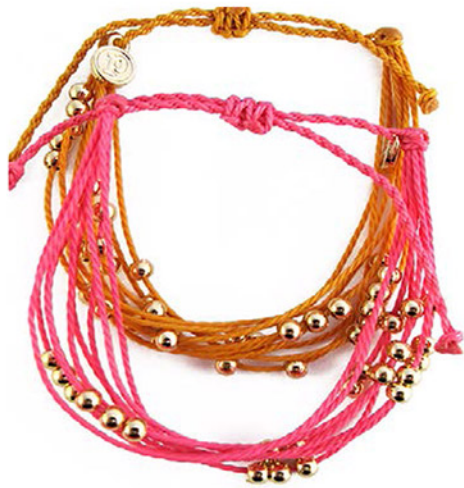
TOP: OCHRE CODE: S17GB43 BOTTOM: PINK CODE: S17GB41 COST: R 120 LENGTH: ADJUSTABLE MATERIALS: COSTUME JEWELLERY