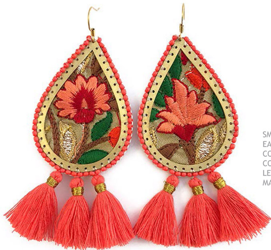
LARGE EMBROIDERED CORAL TASSEL EARRINGS CODE: S17GE13 COST: R 570 LENGTH: 7,2CM MATERIALS: BRASS, SEED BEADS, SILK