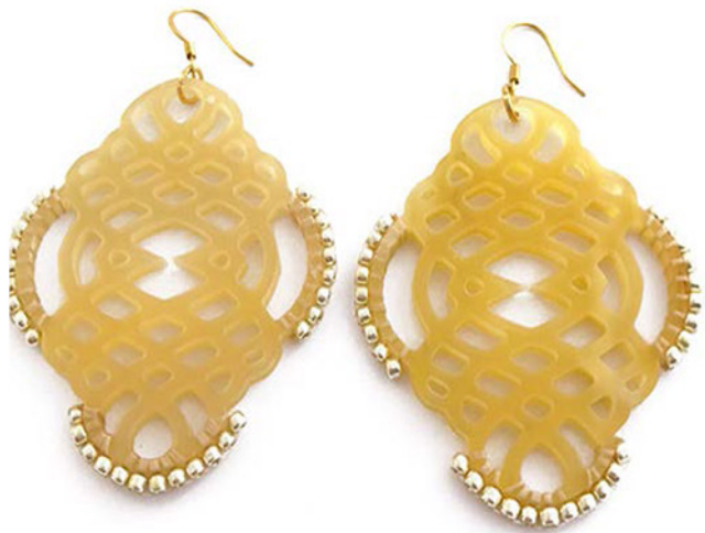
LARGE HORN BEADED FILIGREE EARRINGS CODE: S17GE16 COST: R 330 LENGTH: 8,3CM MATERIALS: HORN, SEED BEADS