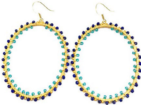
LARGE MATT GOLD BEADED HOOPS WITH LAPIS AND SEED BEADS CODE: S17INE16 COST: R 520 LENGTH: 7,8CM MATERIALS: 22KT GOLD PLATED BRASS, LAPIS LAZULI, SEED BEADS