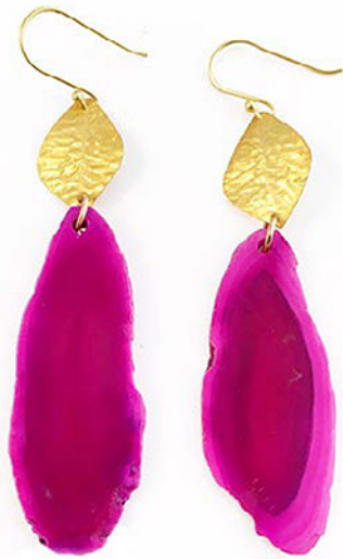
MATT GOLD LEAF EARRINGS WITH CERISE AGATE SLICES CODE: S17GE33 COST: R360 LENGTH: 9,8CM MATERIALS: 22KT GOLD PLATED BRASS, AGATE