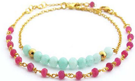
AMAZONITE & RED AVENTURINE BRACELET RONDELLE BRACELET: S17GB23 COST: R 340 AMAZONITE BRACELET: S17GB20 COST: R 120 MATERIALS: 22KT GOLD PLATED BRASS, AMAZONITE, AVENTURINE