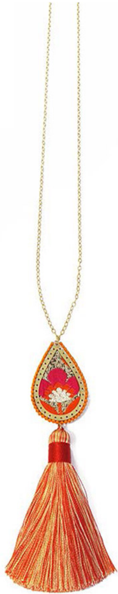
EMBROIDERED FLOWER NECKLACE WITH TANGERINE TASSEL CODE: S17GN34 COST: R 550 LENGTH: 49,5CM MATERIALS: BRASS, 22KT GOLD PLATED CHAIN, SILK