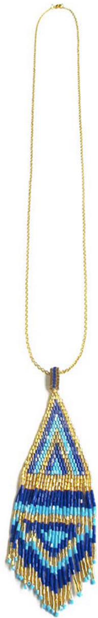
BLUE & GOLD BEADED TASSEL NECKLACE CODE: S17GN9 COST: R380 LENGTH: 53,5CM MATERIALS: 22KT GOLD PLATED BRASS, SEED BEADS