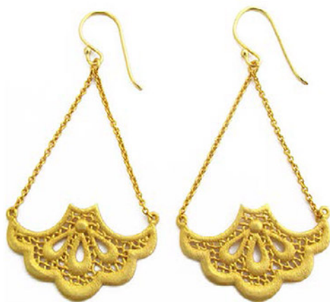
MATT GOLD MOTIF CHAIN EARRINGS CODE: S17INE4 COST: R 350 LENGTH: 8,3CM MATERIALS: 22KT GOLD PLATED BRASS