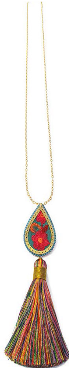
EMBROIDERED FLOWER NECKLACE WITH MULTI-COLOURED TASSEL CODE: S17GN35 COST: R 550 LENGTH: 49,5CM MATERIALS: BRASS, 22KT GOLD PLATED CHAIN, SILK