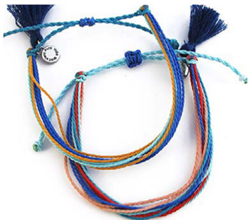
TOP: OCHRE, TURQUOISE, COBALT COST: R 120 CODE: S17GB54 BOTTOM: COBALT, PINK, RED COST: R 120 CODE: S17GB55