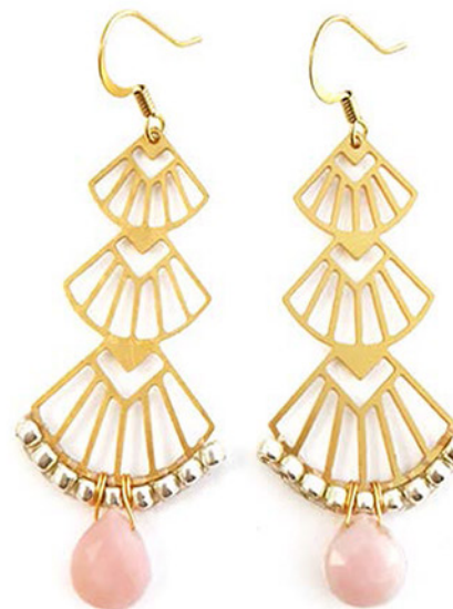
PERUVIAN OPAL FAN EARRINGS CODE: S17GE51 COST: R 350 LENGTH: 6,2CM MATERIALS: BRASS, PERUVIAN OPAL, SEED BEADS