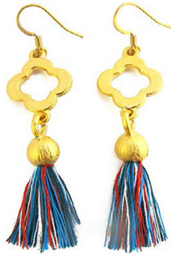
MATT GOLD FLOWER WITH BLUE AND RED TASSELS CODE: S17GE5 COST: R 310 LENGTH: 7CM MATERIALS: 22KT GOLD PLATED BRASS