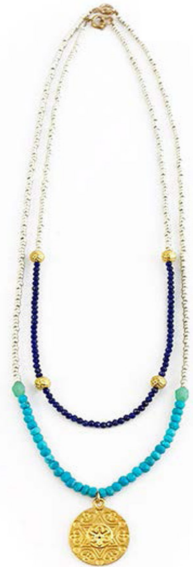
TOP: LAPIS NECKLACE CODE: S17GN15 COST: R 260 BOTTOM: TURQUOISE NECKLACE WITH GOLD DISK CODE: S17GN16 COST: R220