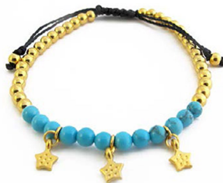
TURQUOISE & GOLD STAR CHARM BRACELET CODE: S17GB11 COST: R 230 LENGTH: ADJUSTABLE MATERIALS: 22KT GOLD PLATED BRASS, TURQUOISE