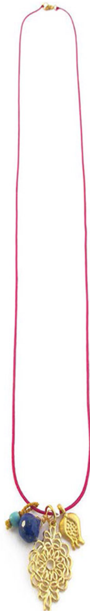
CERISE NECKLACE WITH CHARMS CODE: S17GN12 COST: R 240 LENGTH: 37,5CM MATERIALS: 22KT GOLD PLATED BRASS, LAPIS LAZULI, TURQUOISE, SEED BEADS