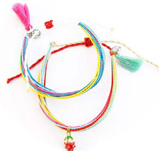
TOP: BRACELET WITH CERISE TASSEL CODE: S17GB53 COST: R140 BOTTOM: STRAWBERRY BRACELET CODE: S17GB60 COST: R105