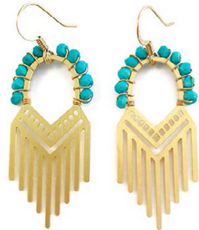
TURQUOISE RONDELLE TRIBAL EARRINGS CODE: S17GE55 COST: R345 LENGTH: 5,7CM MATERIALS: BRASS, TURQUOISE