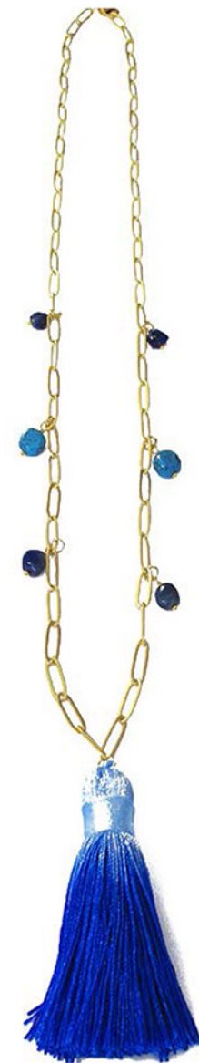
MATT GOLD CHAIN WITH OMBRE TASSEL CODE: W17GN32 COST: R 470 LENGTH: 44,5CM MATERIALS: 22KT GOLD PLATED BRASS, LAPIS, TURQUOISE