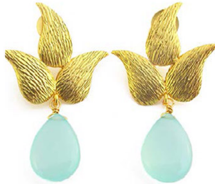
MATT GOLD TEXTURED FLOWER EARRINGS WITH CHALCEDONY CODE: S17INE18 COST: R345 LENGTH: 5CM MATERIALS: 22KT GOLD PLATED BRASS, CHALCEDONY