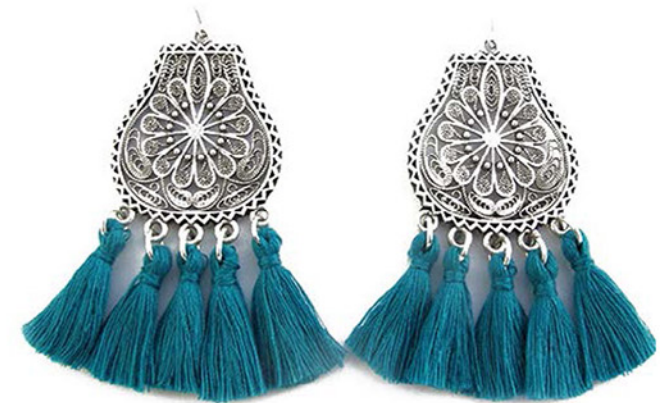
SILVER TURKISH FILIGREE TASSEL EARRINGS CODE: S17SE1 COST: R 460 LENGTH: 8,5CM MATERIALS: SILVER PLATED BRASS