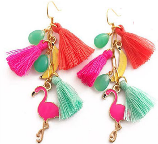
FLAMINGO & BANANA TASSEL EARRINGS CODE: S17GE41 COST: R300 LENGTH: 7,2CM MATERIALS: CHRYSOPRASE & COSTUME