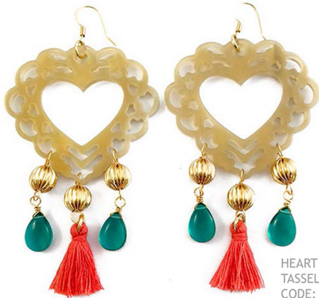
HEART FILIGREE EARRINGS WITH TASSELS AND FLUORITE BRIOLETTES CODE: S17GE44 COST: R 450 LENGTH: 10CM MATERIALS: 22KT GOLD PLATED BRASS, HORN, FLUORITE