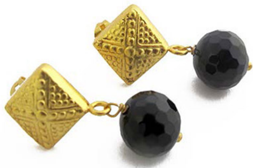
BLACK ONYX DIAMOND SHAPED STUDS CODE: S17INE9 COST: R 350 LENGTH: 3,2CM MATERIALS: 22KT GOLD PLATED BRASS, BLACK ONYX