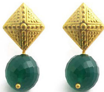
GREEN ONYX DIAMOND SHAPED STUDS CODE: S17INE10 COST: R 350 LENGTH: 3,2CM MATERIALS: 22KT GOLD PLATED BRASS, GREEN ONYX