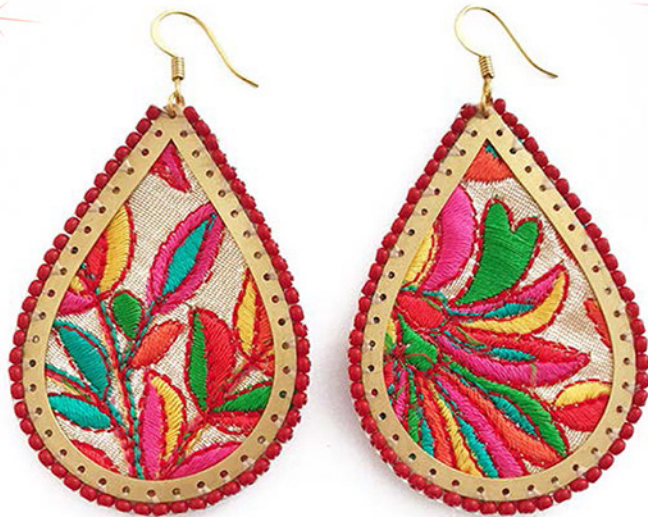
LARGE BRIGHT EMBROIDERED EARRINGS WITH RED SEED BEADS CODE: S17GE14 COST: R 620 LENGTH: 7,2CM MATERIALS: BRASS, SEED BEADS, SILK