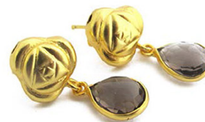
MATT GOLD ROSE STUDS WITH SMOKY QUARTZ CODE: S17INE7 COST: R 380 LENGTH: 2,8CM MATERIALS: 22KT GOLD PLATED BRASS, SMOKY QUARTZ