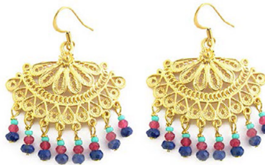
MATT GOLD BEADED FILIGREE FAN EARRINGS WITH GEMS CODE: S17GE4 COST: R 620 LENGTH: 4CM MATERIALS: 22KT GOLD PLATED BRASS, RUBY QUARTZ, LAPIS LAZULI