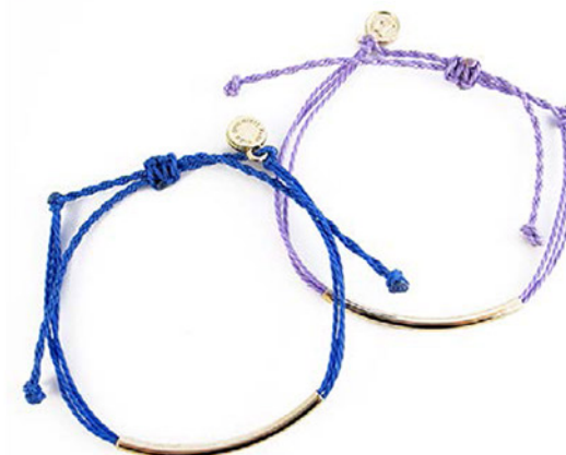
LEFT: COBALT WITH GOLD TUBE CODE: S17GB46 RIGHT: LAVENDER WITH GOLD TUBE CODE: S17GB47 COST: R 110 LENGTH: ADJUSTABLE MATERIALS: COSTUME JEWELLERY