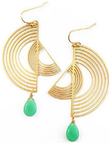
SEMI CIRCLE EARRINGS WITH CHRYSTOPRASE BRIOLETTES CODE: S17GE46 COST: R315 LENGTH: 7,1CM MATERIALS: BRASS, CHRYSTOPRASE