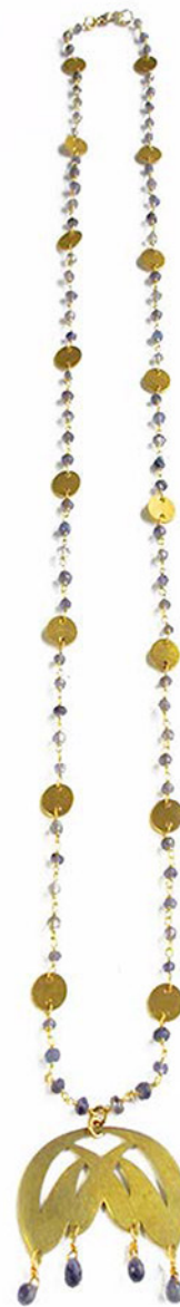
IOLITE RONDELLE CHAIN WITH DISKS AND TULIP PENDANT CODE: S17GN28 COST: R 670 LENGTH: 40,5CM MATERIALS: 22KT GOLD PLATED BRASS, IOLITE