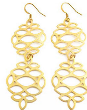
MATT GOLD DOUBLE EARRINGS CODE: S17GE34 COST: R 300 LENGTH: 8,7CM MATERIALS: 22KT GOLD PLATED BRASS