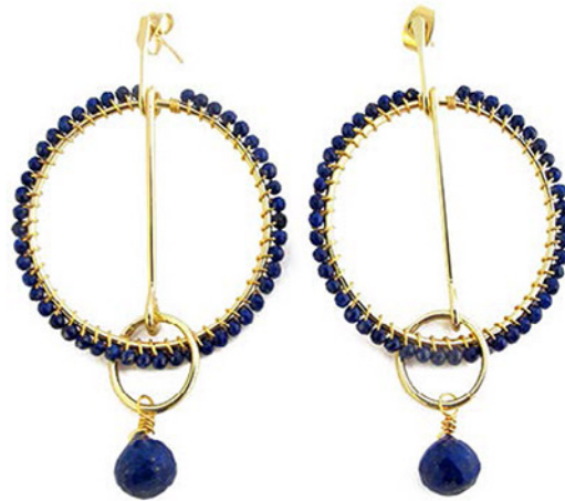
SHINY GOLD CIRCLE EARRINGS WITH LAPIS LAZULI CODE: S17GE22 COST: R 410 LENGTH: 7CM MATERIALS: 22KT GOLD PLATED BRASS, LAPIS LAZULI