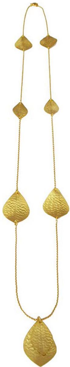
LONG MATT GOLD LEAF NECKLACE CODE: S17INN2 COST: R 460 LENGTH: 48CM MATERIALS: 22KT GOLD PLATED BRASS