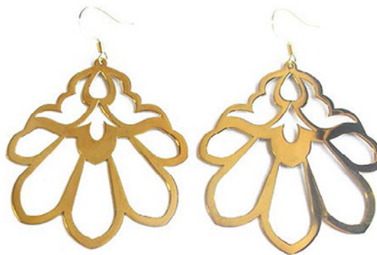
LARGE SHINY SAMMY FLOWER EARRINGS CODE: S17GE24 COST: R 470 LENGTH: 7,5CM MATERIALS: BRASS