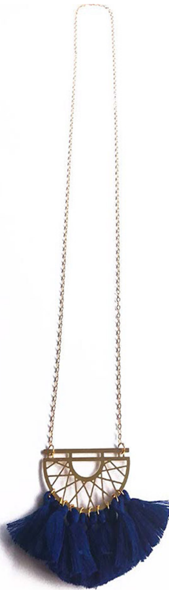
MATT GOLD GEOMETRIC PENDANT WITH NAVY TASSELS CODE: S17GN30 COST: R350 LENGTH: 43,5CM MATERIALS: 22KT GOLD PLATED BRASS