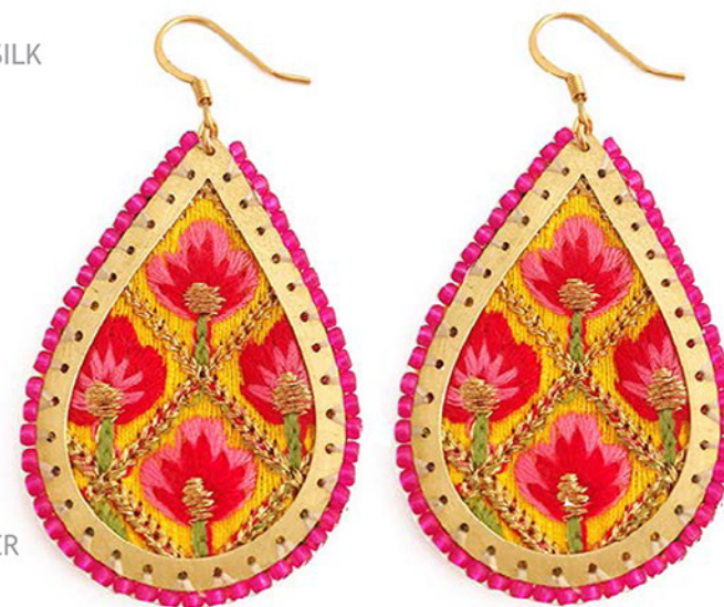
SMALL YELLOW AND PINK FLOWER EMBROIDERED EARRINGS CODE: S17GE59 COST: R 520 LENGTH: 6,5CM MATERIALS: BRASS, SEED BEADS, SILK