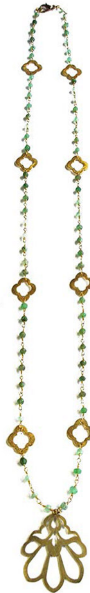
CHRYSTOPRASE RONDELLE CHAIN WITH FLOWER PENDANT CODE: S17GN27 COST: R480 LENGTH: 39,5CM MATERIALS: 22KT GOLD PLATED BRASS, CHRYSTOPRASE