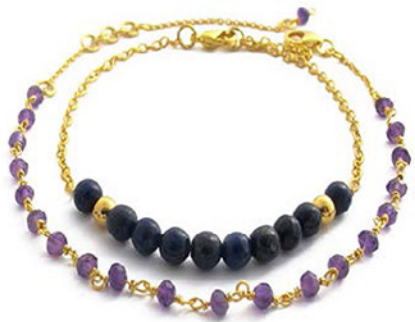
LAPIS & AMETHYST BRACELETS RONDELLE BRACELET CODE: S17GB25 COST: R 345 LAPIS BRACELET CODE: S17GB22 COST: R 120 MATERIALS: LAPIS, AMETHYST 22KT GOLD PLATED BRASS