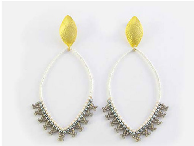
MATT SILVER & GOLD BEADED EARRINGS CODE: S17INE20 COST: R 360 LENGTH: 8,2CM MATERIALS: 22KT GOLD PLATED BRASS, SILVER PLATED BRASS, SEED BEADS