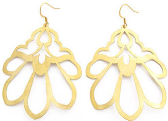
LARGE MATT SAMMY FLOWER EARRINGS CODE: S17GE25 COST: R 380 LENGTH: 7,5CM MATERIALS: BRASS