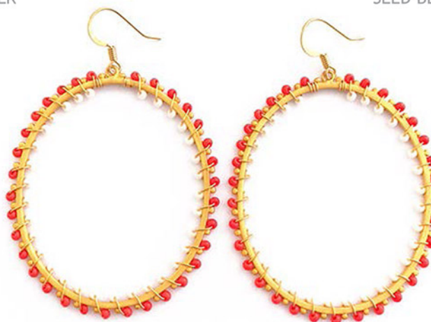
LARGE MATT GOLD BEADED HOOPS WITH CORAL & WHITE SEED BEADS CODE: S17INE15 COST: R 460 LENGTH: 7,5CM MATERIALS: 22KT GOLD PLATED BRASS, SEED BEADS