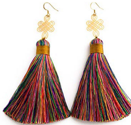
CELTIC KNOTTED EARRINGS WITH LARGE MULTI-COLOURED TASSEL CODE: S17GE56 COST: R 460 LENGTH: 12.5CM MATERIALS: 22KT GOLD PLATED