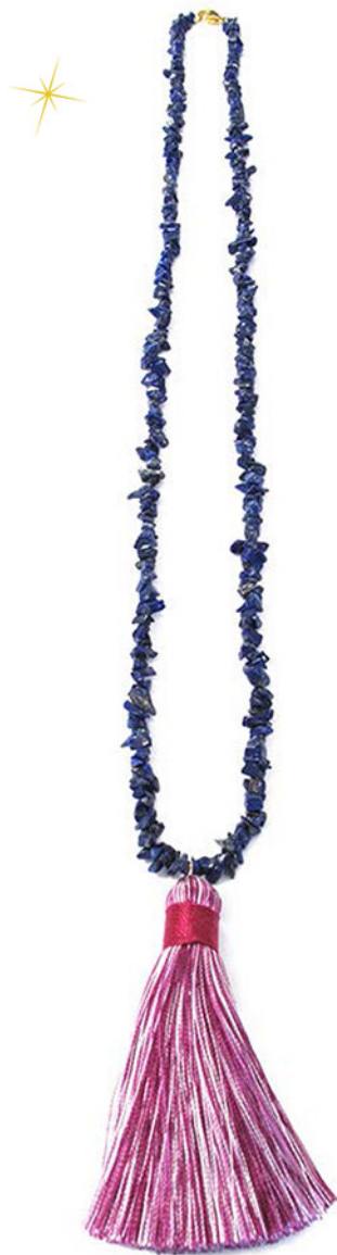
LAPIS LAZULI WITH CERISE TASSEL CODE: S17GN6 COST: R 350 LENGTH: 49,5CM MATERIALS: LAPIS LAZULI