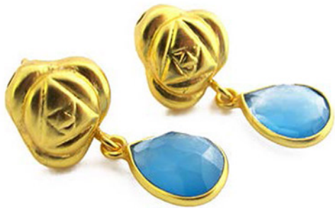
MATT GOLD ROSE STUDS WITH BLUE CHALCEDONY CODE: S17INE6 COST: R 380 LENGTH: 2,8CM MATERIALS: 22KT GOLD PLATED BRASS, CHALCEDONY