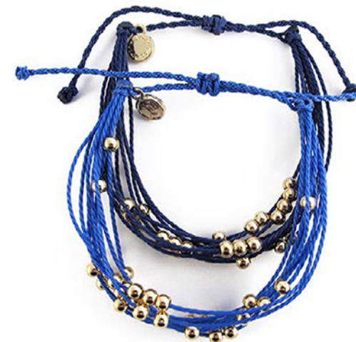
TOP: NAVY CODE: S17GB42 BOTTOM: COBALT BLUE CODE: S17GB40 COST: R 140 LENGTH: ADJUSTABLE