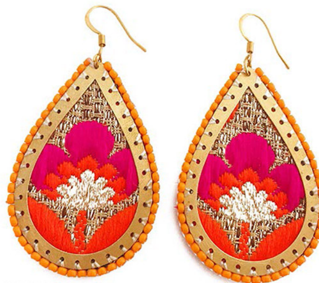
SMALL FLOWER EMBROIDERED EARRINGS WITH ORANGE SEED BEADS CODE: S17GE61 COST: R 520 LENGTH: 6,5CM MATERIALS: BRASS, SEED BEADS, SILK