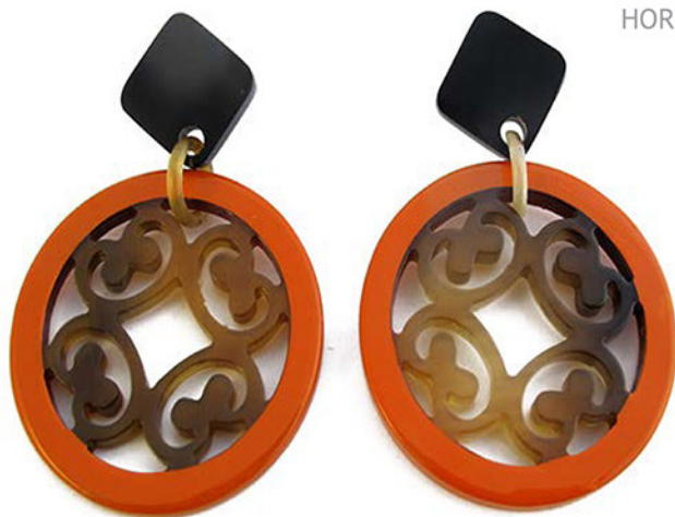
CHINESE CUT OUT EARRINGS CODE: S17GE2 COST: R 350 LENGTH: 5CM MATERIALS: LACQUERED HORN