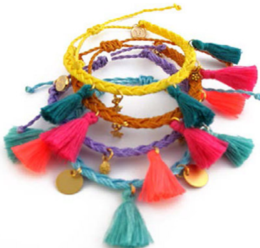
YELLOW (DETAILS BELOW) OCHRE WITH PINK TASSELS CODE: S17GB58 PURPLE WITH TANGERINE TASSELS CODE: S17GB59 TURQUOISE WITH GREEN TASSELS CODE: S17GB51