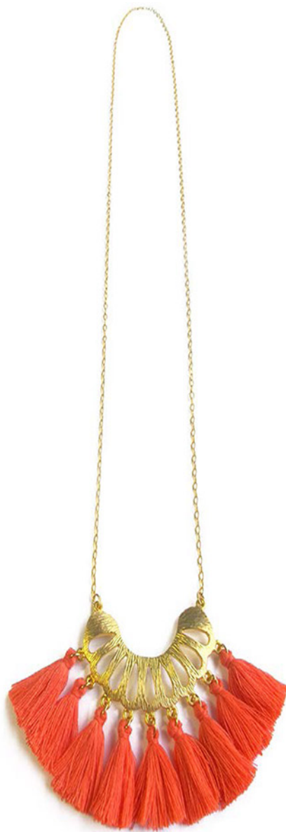
MATT GOLD PENDANT WITH CORAL TASSELS CODE: S17GN19 COST: R 560 LENGTH: 43,5CM MATERIALS: 22KT GOLD PLATED BRASS