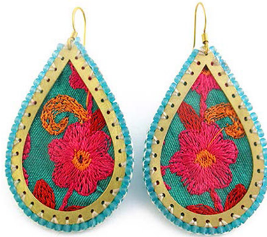
SMALL EMERALD GREEN AND PINK EMBROIDERED EARRINGS CODE: S17GE10 COST: R520 LENGTH: 6,2CM MATERIALS: BRASS, SEED BEADS, SILK