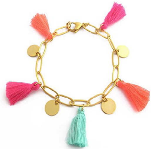
MATT GOLD DISK AND TASSEL BRACELET CODE: S17GB36 COST: R 250 LENGTH: 21CM/ADJUSTABLE MATERIALS: 22KT GOLD PLATED BRASS