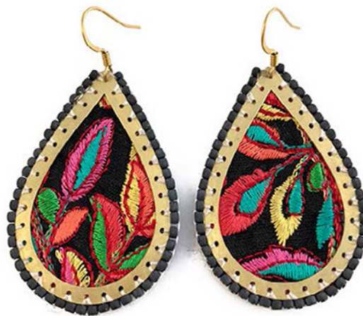
SMALL BLACK EMBROIDERED EARRINGS CODE: S17GE11 COST: R 550 LENGTH: 6,2CM MATERIALS: BRASS, SEED BEADS, SILK