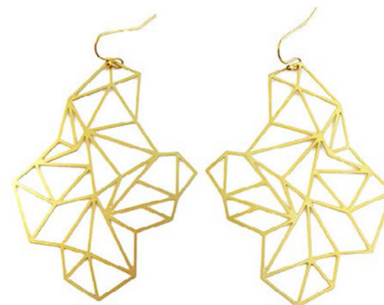
GEOMETRIC EARRINGS CODE: S17GE43 COST: R 350 LENGTH: 7,8CM MATERIALS: BRASS