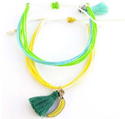
BRIGHT GREEN & TURQ BRACELET CODE: S17GB42 COST: R 140 YELLOW BRACELET WITH BANANA CODE: S17GB40 COST: R 160