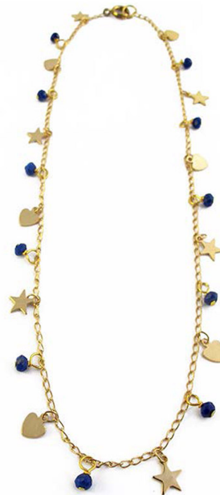
MATT GOLD HEART & STAR CHOKER WITH LAPIS RONDELLES CODE: S17GN20 COST: R290 LENGTH: 19CM MATERIALS: 22KT GOLD PLATED BRASS, LAPIS LAZULI