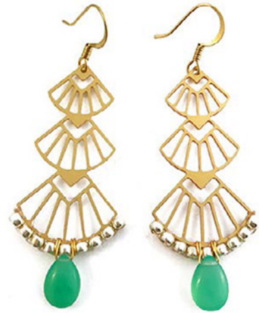
CHRYSTOPRASE FAN EARRINGS CODE: S17GE50 COST: R 345 LENGTH: 6,8CM MATERIALS: BRASS, CHRYSTOPRASE, SEED BEADS