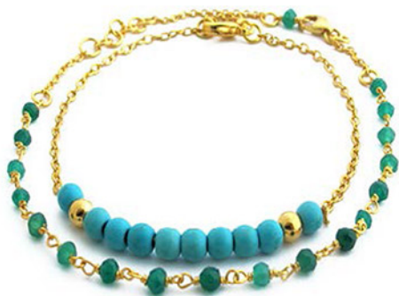
TURQUOISE & GREEN ONYX BRACELETS GREEN RONDELLE CODE: S17GB24 COST: R 300 TURQUOISE BRACELET CODE: S17GB21 COST: R 120 MATERIALS: 22KT GOLD PLATED BRASS, TURQUOISE, GREEN ONYX