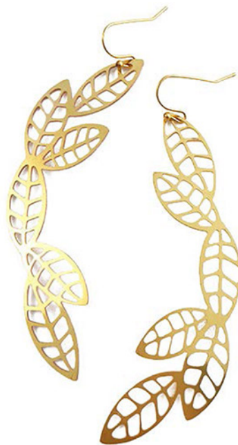
LONG ORNATE LEAF EARRINGS CODE: S17GE42 COST: R 330 LENGTH: 8,5CM MATERIALS: BRASS