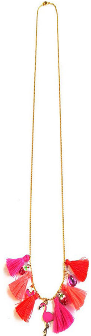
PINK FLAMINGO AND TASSEL NECKLACE CODE: S17GN23 COST: R 360 LENGTH: 41,5CM MATERIALS: 22KT GOLD PLATED BRASS, COSTUME JEWELLERY CHARMS