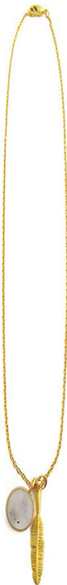
MATT GOLD MOONSTONE & BANANA LEAF NECKLACE CODE: S17INN3 COST: R 390 LENGTH: 24CM MATERIALS: 22KT GOLD PLATED BRASS, MOONSTONE