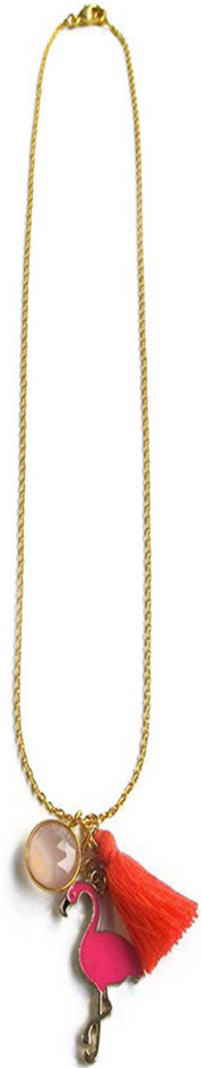
NECKLACE WITH FLAMINGO AND SET ROSE QUARTZ CODE: S17INN4 COST: R 300 LENGTH: 25,2CM MATERIALS: 22KT GOLD PLATED BRASS, ROSE QUARTZ