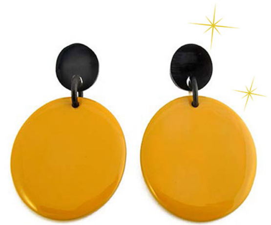
ROUND YELLOW LACQUERED EARRINGS CODE: S17GE1 COST: R 310 LENGTH: 4,8CM MATERIALS: LACQUERED HORN