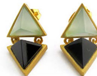
CHALCEDONY & BLACK ONYX TRIANGLE STUDS CODE: S17INE2 COST: R 350 LENGTH: 2,2CM MATERIALS: 22KT GOLD PLATED BRASS, CHALCEDONY, BLACK ONYX