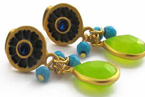
SAPPHIRE FLOWER WITH GREEN CHALCEDONY EARRINGS CODE: S17INE22 COST: R 380 LENGTH: 3,2CM MATERIALS: 22KT GOLD PLATED BRASS, BLUE SAPPHIRE, GREEN CHALCEDONY, TURQUOISE