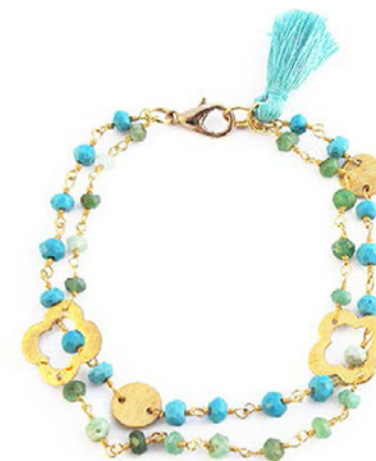
CHRYSOPRASE & TURQUOISE DOUBLE BRACELET CODE: S17GB62 COST: R 350 LENGTH: 19,5CM MATERIALS: 22KT GOLD PLATED BRASS, CHRYSOPRASE, TURQUOISE