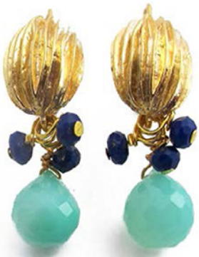
MATT GOLD WALNUT EARRINGS WITH CHRYSTOPRASE BRIOLETTES CODE: S17GE31 COST: R345 LENGTH: 3,4CM MATERIALS: 22KT GOLD PLATED BRASS, CHRYSTOPRASE, LAPIS LAZULI