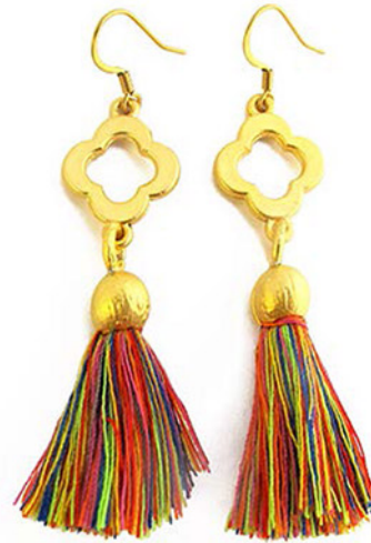
MATT GOLD FLOWER WITH MULTI-COLOURED TASSEL CODE: S17GE6 COST: R 310 LENGTH: 7CM MATERIALS: 22KT GOLD PLATED BRASS