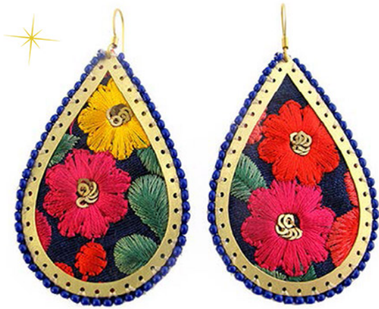
LARGE NAVY EMBROIDERED EARRINGS CODE: S17GE12 COST: R 580 LENGTH: 7,2CM MATERIALS: BRASS, SEED BEADS, SILK