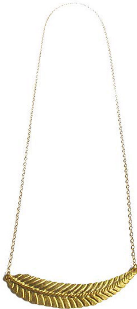
MATT GOLD LEAF NECKLACE CODE: S17GN2 COST: R 300 LENGTH: 40CM MATERIALS: 22KT GOLD PLATED BRASS