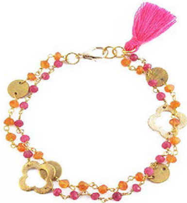
CARNELIAN & PINK RUBY DOUBLE BRACELET CODE: S17GB63 COST: R 350 LENGTH: 19,5CM MATERIALS: 22KT GOLD PLATED BRASS, CARNELIAN, RUBY QUARTZ