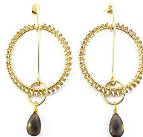
SHINY GOLD CIRCLE EARRINGS WITH SMOKY QUARTZ CODE: S17GE23 COST: R 410 LENGTH: 7,1CM MATERIALS: 22KT GOLD PLATED BRASS, SMOKY QUARTZ, SEED BEADS