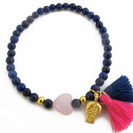
LAPIS BEADS WITH ROSE QUARTZ HEART AND TASSELS CODE: S17GB14 COST: R 200 LENGTH: ADJUSTABLE MATERIALS: 22KT GOLD PLATED BRASS, LAPIS LAZULI, ROSE QUARTZ