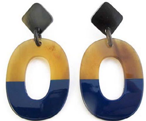
NAVY DIPPED OVAL EARRINGS CODE: S17GE20 COST: R 310 LENGTH: 6,8CM MATERIALS: LACQUERED HORN