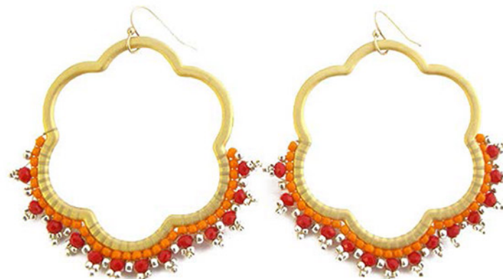
MATT GOLD BEADED FLOWER EARRINGS CODE: S17GE7 COST: R 430 LENGTH: 5,4CM MATERIALS: 22KT GOLD PLATED BRASS, SEED BEADS