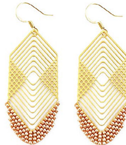
ROSE GOLD BEADED GEOMETRIC EARRINGS CODE: S17GE49 COST: R 350 LENGTH: 6,7CM MATERIALS: BRASS, SEED BEADS