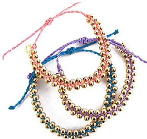
PINK & GOLD ADJUSTABLE BRACELET CODE: S17GB50 PURPLE & GOLD ADJUSTABLE BRACELET CODE: S17GB49 BLUE & GOLD ADJUSTABLE BRACELET CODE: S17GB48 COST: R 140