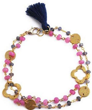
IOLITE & PINK RUBY DOUBLE BRACELET CODE: S17GB61 COST: R 420 LENGTH: 19,5CM MATERIALS: 22KT GOLD PLATED BRASS, IOLITE, PINK RUBY