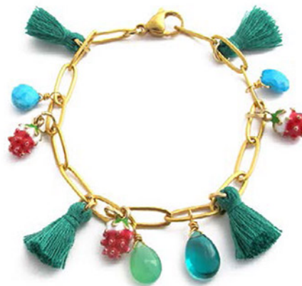
MATT GOLD CHAIN WITH STRAWBERRIES, TASSELS AND GEMS CODE: S17GB29 COST: R 310 LENGTH: ADJUSTABLE MATERIALS: 22KT GOLD PLATED BRASS, CHRYSOPHASE, FLUORITE, TURQUOISE