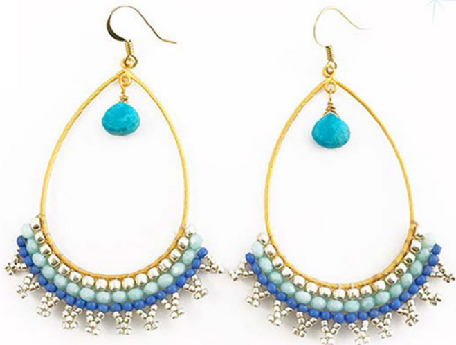
MATT GOLD BEADED TEARDROP EARRINGS WITH TURQUOISE BRIOLETTE CODE: S17GE53 COST: R 450 LENGTH: 8CM MATERIALS: 22KT GOLD PLATED BRASS, TURQUOISE, SEED BEADS