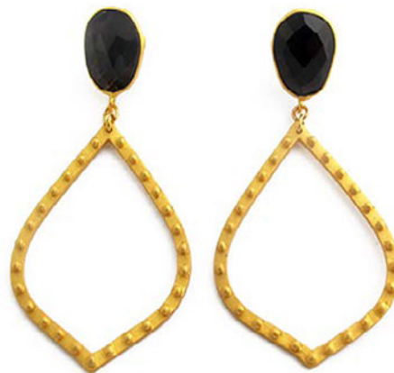
MATT GOLD STUDDED EARRINGS WITH BLACK ONYX CODE: S17INE12 COST: R 620 LENGTH: 6CM MATERIALS: 22KT GOLD PLATED BRASS, BLACK ONYX