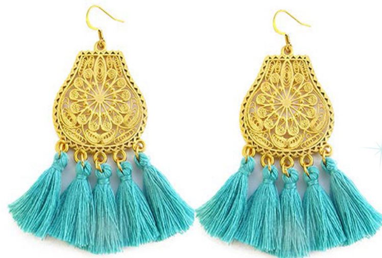
MATT GOLD TURKISH FILIGREE TASSEL EARRINGS CODE: S17GE17 COST: R 520 LENGTH: 8,5CM MATERIALS: 22KT GOLD PLATED BRASS