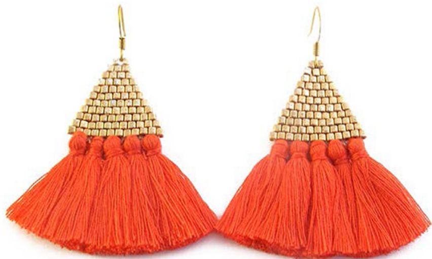
TRIANGLE ROSE GOLD AND CORAL TASSEL EARRINGS CODE: S17GE39 COST: R 300 LENGTH: 6,5CM MATERIALS: SEED BEADS