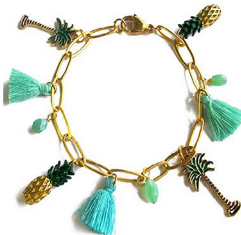
MATT GOLD CHAIN WITH CHARMS AND TASSELS CODE: S17GB30 COST: R 310 LENGTH: ADJUSTABLE MATERIALS: 22KT GOLD PLATED BRASS, CHRYSOPRASE, COSTUME CHARMS