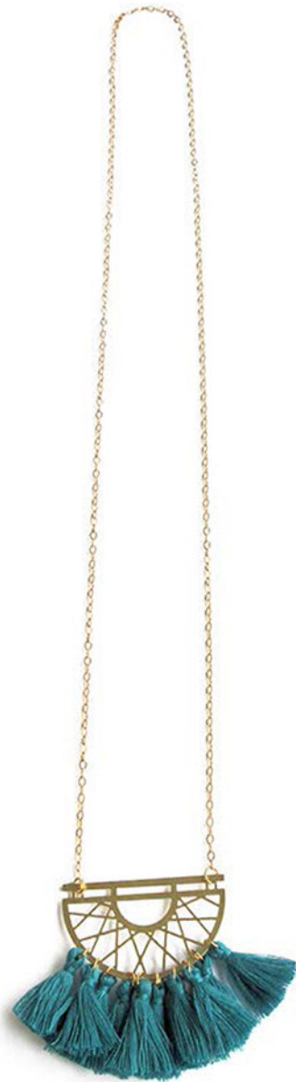
MATT GOLD GEOMETRIC PENDANT WITH TEAL TASSELS CODE: S17GN31 COST: R220 LENGTH: 43,5CM MATERIALS: 22KT GOLD PLATED BRASS