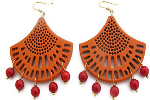
TANGERINE FAN EARRINGS WITH BAMBOO CORAL CODE: S17GE35 COST: R300 LENGTH: 7,7CM MATERIALS: HORN, BAMBOO CORAL