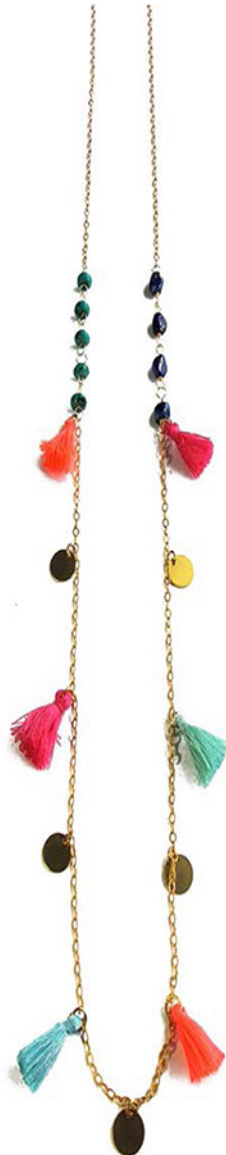
CHAIN WITH TASSELS, DISKS, HOWLITE & LAPIS CODE: S17GN29 COST: R 410 LENGTH: 47,5CM MATERIALS: 22KT GOLD PLATED BRASS, LAPIS, GREEN HOWLITE