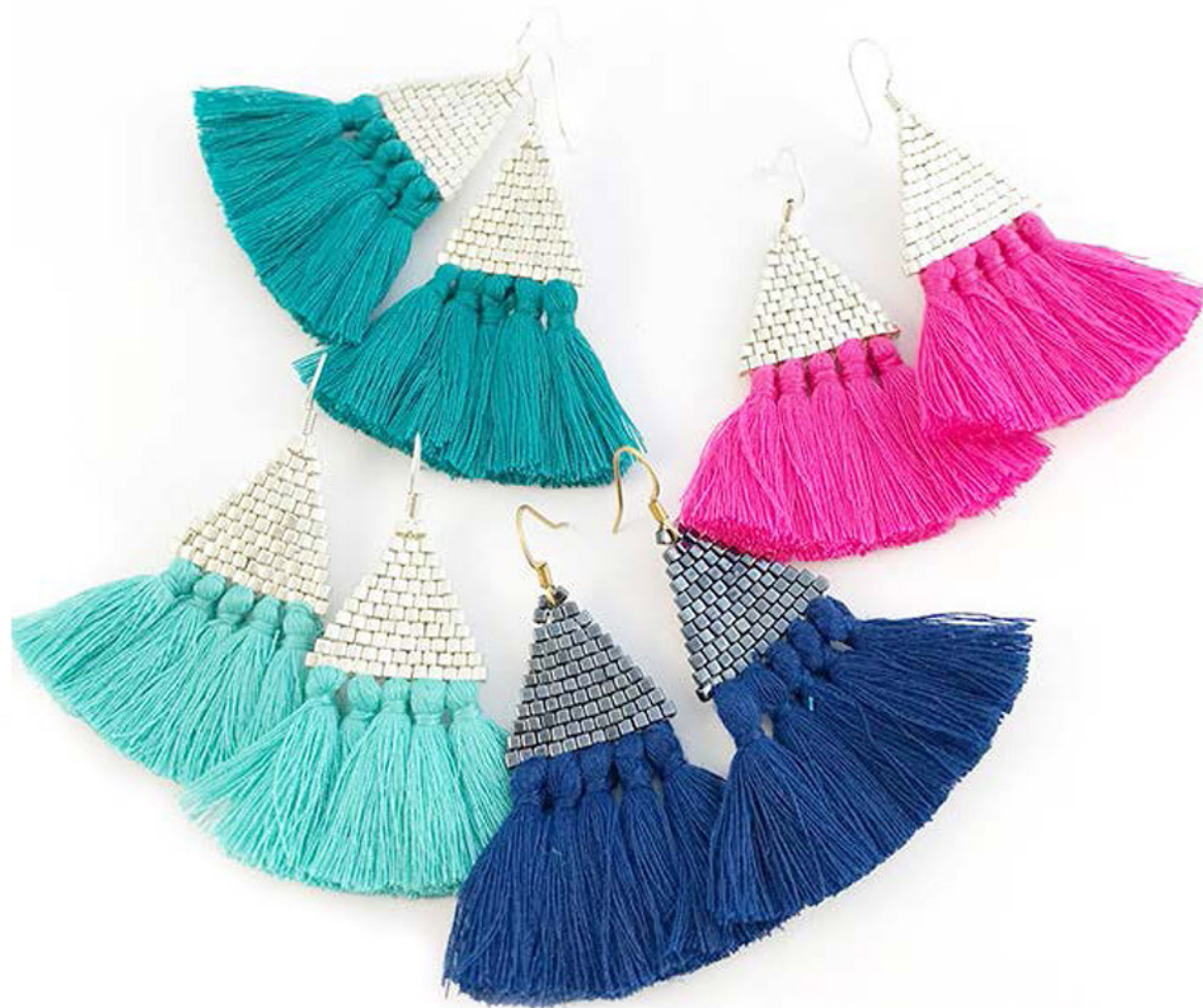
TRIANGLE TASSEL EARRINGS NAVY: S17GE40 LIGHT GREEN: S17SE4 DARK GREEN: S17SE3 BRIGHT PINK: S17SE2 COST: R 300