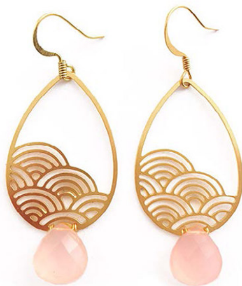
WAVE TEARDROPS WITH ROSE QUARTZ CODE: S17GE52 COST: R 410 LENGTH: 5,8CM MATERIALS: 22KT GOLD PLATED BRASS, ROSE QUARTZ