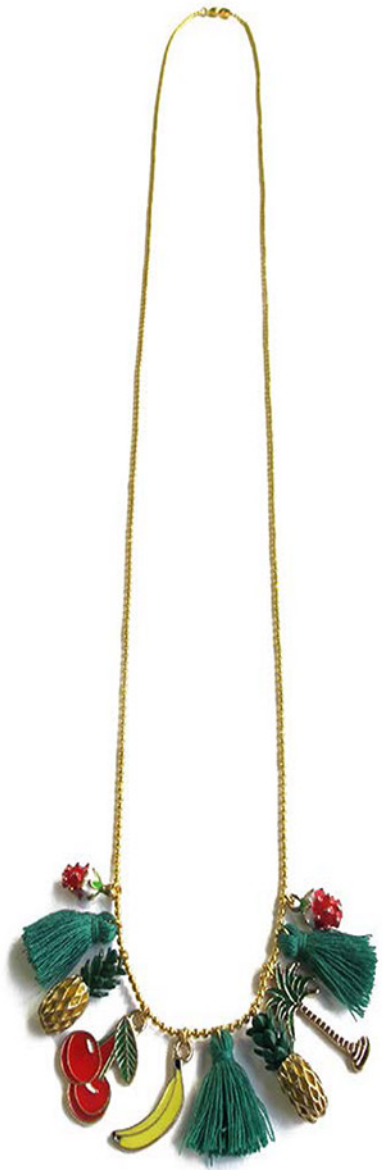
FRUITY TOOTY NECKLACE CODE: S17GN22 COST: R230 LENGTH: 40,5CM MATERIALS: 22KT GOLD PLATED BRASS, COSTUME JEWELLERY CHARMS