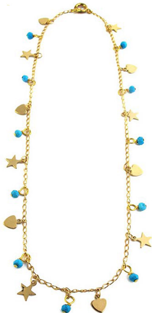
MATT GOLD HEART & STAR CHOKER WITH TURQUOISE RONDELLES CODE: S17GN21 COST: R280 LENGTH: 19CM MATERIALS: 22KT GOLD PLATED BRASS, TURQUOISE