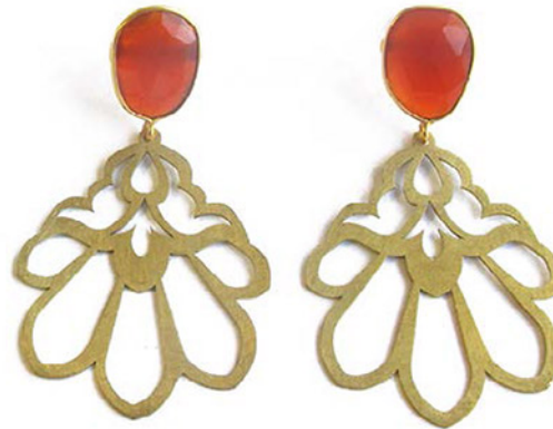
CARNELIAN FLOWER EARRINGS CODE: S17GE38 COST: R520 LENGTH: 5CM MATERIALS: 22KT GOLD PLATED BRASS, CARNELIAN