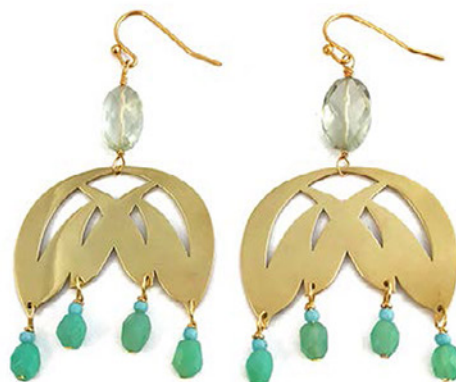
SHINY TULIP EARRINGS WITH GREEN AMETHYST AND CHRYSOPRASE CODE: S17GE29 COST: R 580 LENGTH: 6,5CM MATERIALS: BRASS, GREEN AMETHYST, CHRYSOPRASE