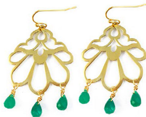
SMALL SHINY FLOWER EARRINGS WITH GREEN ONYX BRIOLETTES CODE: S17GE28 COST: R 500 LENGTH: 5,8CM MATERIALS: BRASS, GREEN ONYX