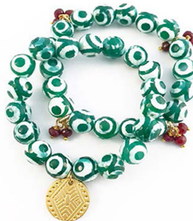
TOP: AGATE & RUBY QUARTZ BRACELET CODE: S17GB38 COST: R180 BOTTOM: AGATE AND GOLD CHARM CODE: S17GB39 COST: R 220