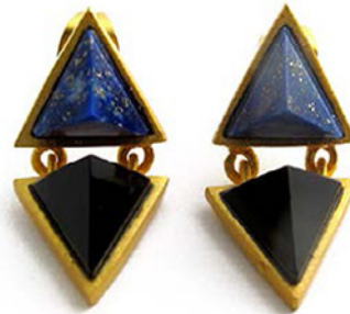
MATT GOLD LAPIS & BLACK ONYX TRIANGLE STUDS CODE: S17INE1 COST: R 350 LENGTH: 2,2CM MATERIALS: 22KT GOLD PLATED BRASS, LAPIS LAZULI, BLACK ONYX