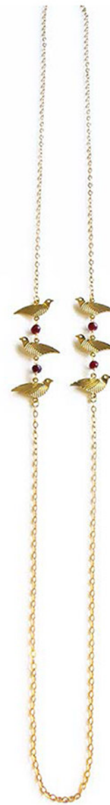
LONG GOLD NECKLACE WITH BIRDS AND RUBY QUARTZ RONDELLES CODE: S17GN10 COST: R 350 LENGTH: 47CM MATERIALS: 22KT GOLD PLATED BRASS, RUBY QUARTZ