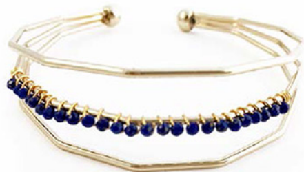
SHINY GOLD TRIPLE BRACELET WRAPPED WITH LAPIS LAZULI RONDELLES CODE: S17GB28 COST: R 350 LENGTH: ADJUSTABLE MATERIALS: 22KT GOLD PLATED BRASS, LAPIS LAZULI