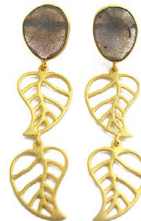
MATT GOLD LABRADORITE LEAF EARRINGS CODE: S17INE11 COST: R 620 LENGTH: 5,8CM MATERIALS: 22KT GOLD PLATED BRASS, LABRADORITE