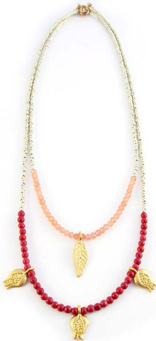
TOP: PINK CHALCEDONY NECKLACE WITH LEAF CODE: S17GN17 COST: R 280 BOTTOM: RED CORAL NECKLACE WITH POMEGRANATES CODE: S17GN18 COST: R160