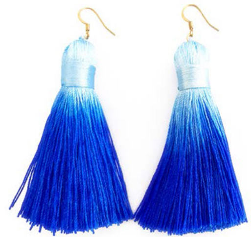
BLUE OMBRE TASSEL EARRINGS CODE: S17GE57 COST: R 220 LENGTH: 9CM